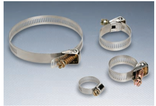
C208 Clamp (1/2" I.D. Minimum)